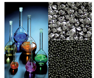
Polishing media and compounds