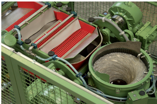
Compact machine system MPA 07/1 E-A