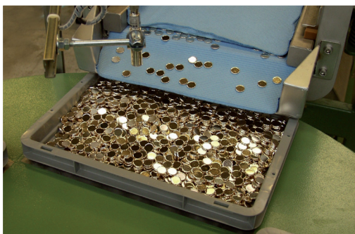
Stain- and dustfree warm textile drying