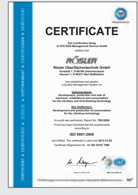
ISO 9001: 2008