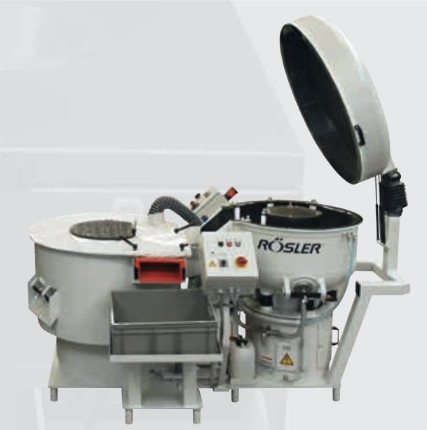
Our power package RCC1 with RCD1 - cleaning, drying and polishing of cutlery. Ideal for caterer with huge amounts.

When it comes to dealing with cleaning, drying polishing of cutlery, Rösler offers the total process solution! Through extensive processing trials, we always find the right finishing solution for our customer's needs.