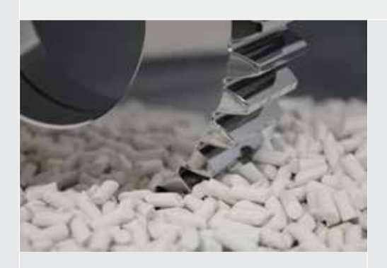
Special process Keramo® Finish – High gloss finish for your cutlery!