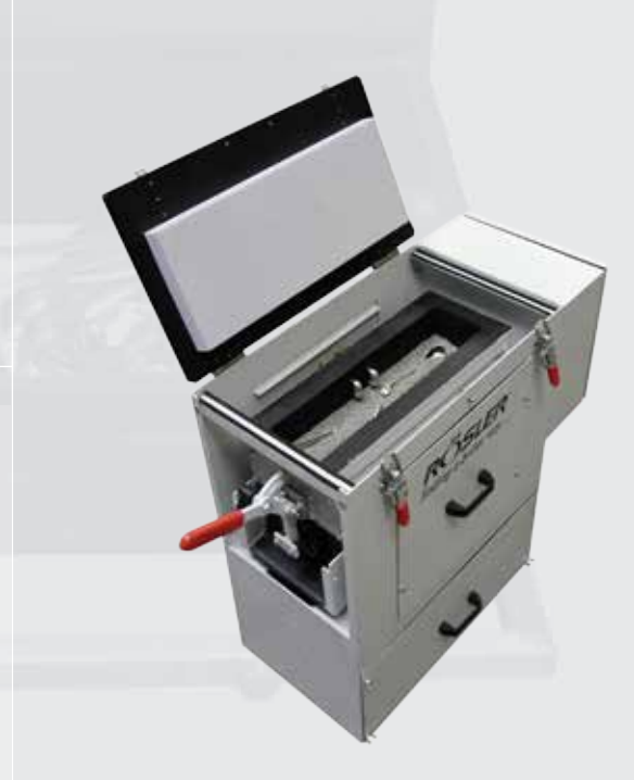
RCT1 - the small alternative for cleaning cutlery